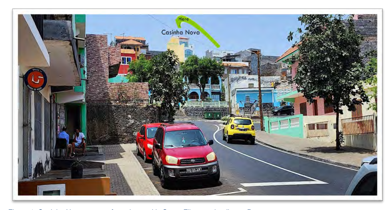
Figure 1. Casinha Nova as seen from the road in Santa Filomena leading to Property.

Baragonta – Casinha Nova Santa Filomena/Terra Branca São Filipe, Fogo Cabo Verde