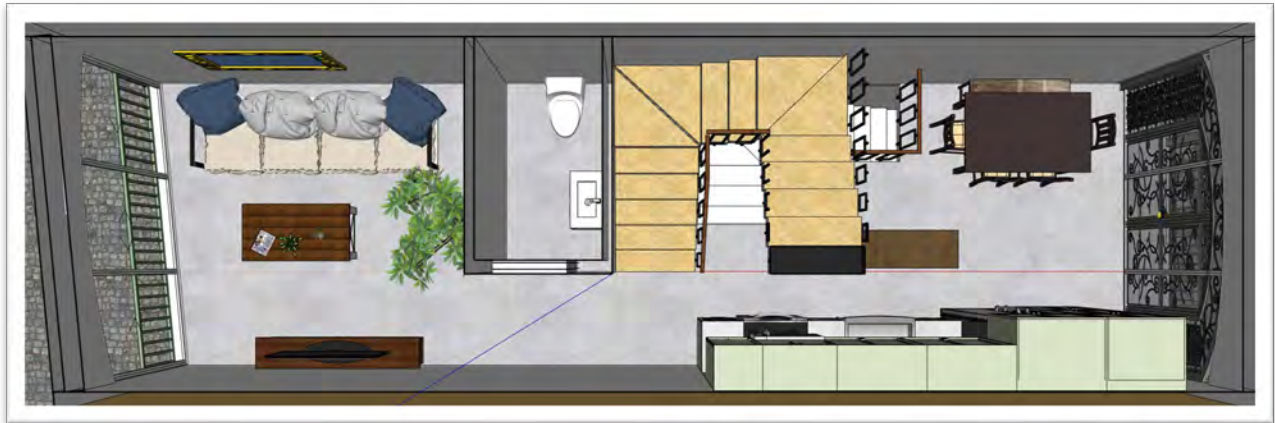
Figure 1: Ground Floor, Kitchen - Living Room

Above is a simple map of the ground floor of the home. Information and special rules on specific parts of the house are written below, so you can easily understand where things are located and how to use them safely.